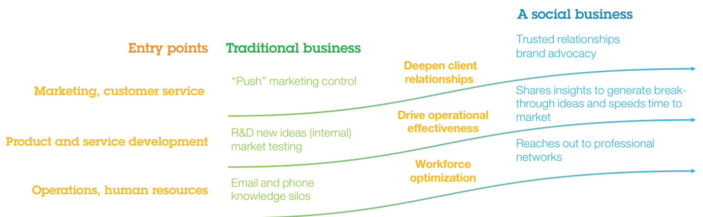
Figure 1: The point at which each business begins its transformation to social business varies, but every social business drives value by making traditional communication and collaboration networks more efficient, authentic and flexible.

In addition, as workforces become more globally distributed and remote—and as barriers between work and personal time continue to dissolve—people do indeed need more-effective ways to exchange information and share ideas. They must be able to hold meetings, share insights, make deals and purchase goods at any time, from wherever they are, through the devices and interfaces of their choice.